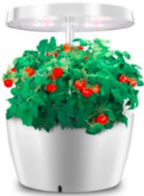
SMART HYDROPONIC PLANTING BOX