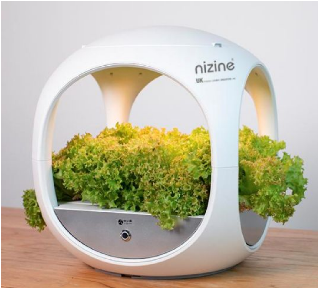
INTELLIGENT INDOOR HYDROPONIC GROWING PLANTER