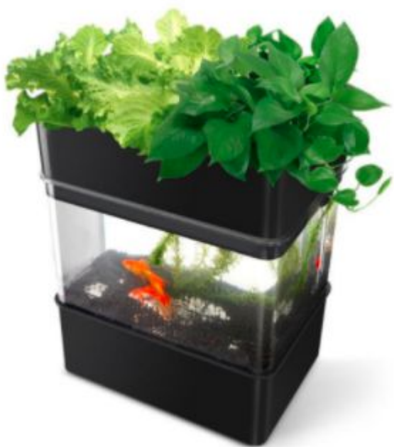
SMALL TABLE AQUAPONIC SYSTEM