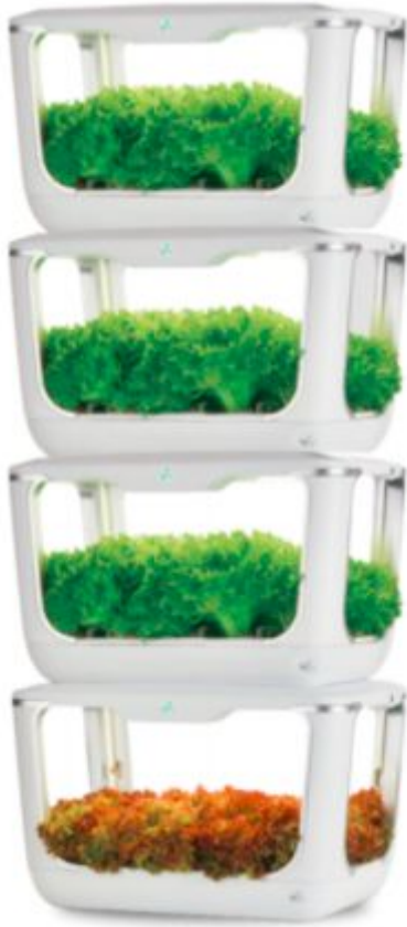
HYDROPONIC GROW BOX