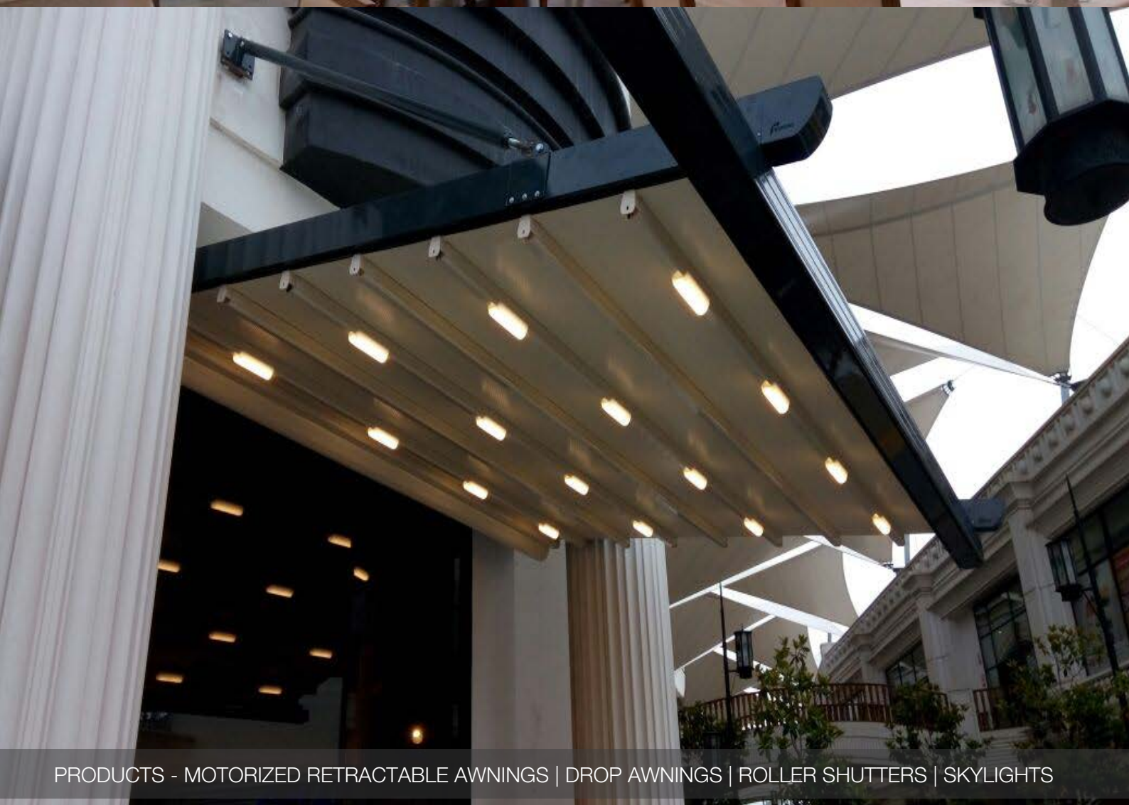
PRODUCTS - MOTORIZED RETRACTABLE AWNINGS | DROP AWNINGS | ROLLER SHUTTERS | SKYLIGHTS